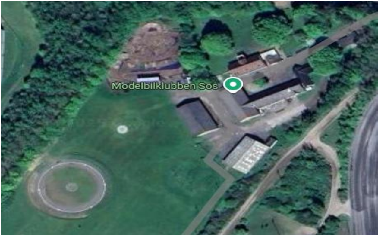
The Circle and surroundings.